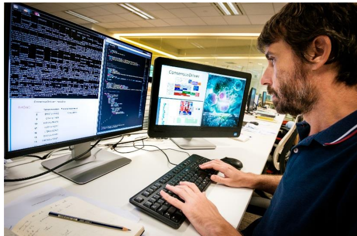
Singapore scientists discover new computer system that uses data from multiple sources to better treat cancer.

SINGAPORE – Scientists in Singapore have made a unique discovery about how to treat cancers – when it comes to pinpointing cancer treatment targets, it is better to listen to many computer programmes rather than just one. Researchers have developed an advanced system that integrates this 'wisdom of the crowd' through a powerful consensus algorithm to isolate the Achilles heel of each individual cancer tumour, helping scientists to better study different cancers and identify targeted treatments.