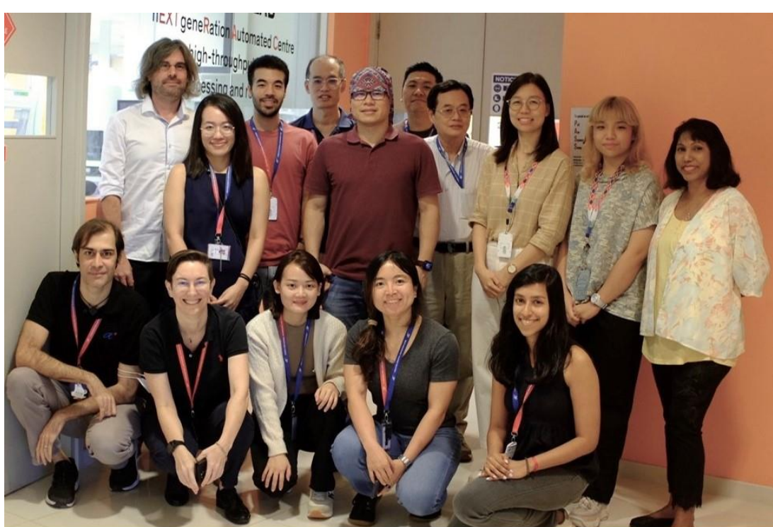
GIS Super Team awardees: NPM Phase 2 (GRIDS, NPCO and EXTRACT Team)

The Genome Institute of Singapore held its annual Town Hall on 26 July 2023. An award ceremony was incorporated in the event, recognising groups and individuals that had made significant contributions to research, or shown outstanding performance and achievements in the previous year (2022).