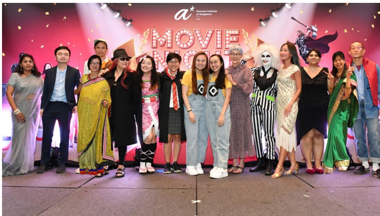
GIS Super Team awardees: GIS Recreation Club Committee (file photo from GIS Dinner and Dance 2023)