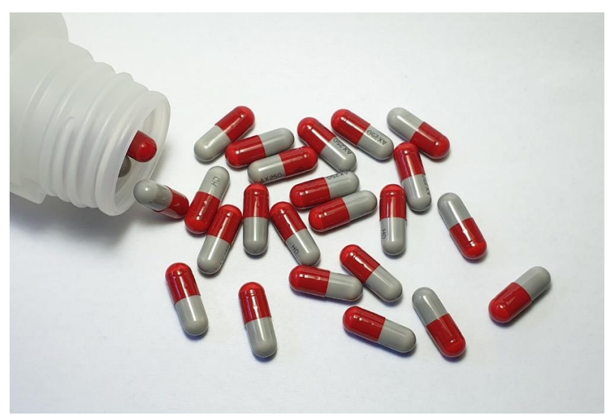
Antibiotics are some of the most widely used drugs, yet their side effects on gut bacteria are not fully understood

Discovery of gut bacteria critical to restoring gut health offers new insights into microbiome recovery after antibiotic treatment