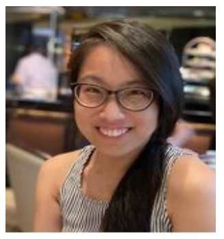
Highly motivated immunologist with more than 10 years of experience analyzing T cell functions, antibody responses and tissue macrophage characterization, developing in vitro assays using primary human and mouse samples as well as in vivo animal modelling. Excited to apply immunological skillsets to achieve translational goals. Flexibility to drive projects independently or collaborate in teams.