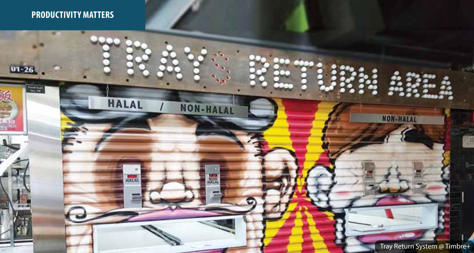
Tray Return System @ Timbre+