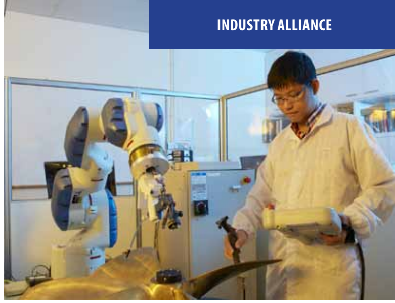
Intuitive robot teaching for tool paths