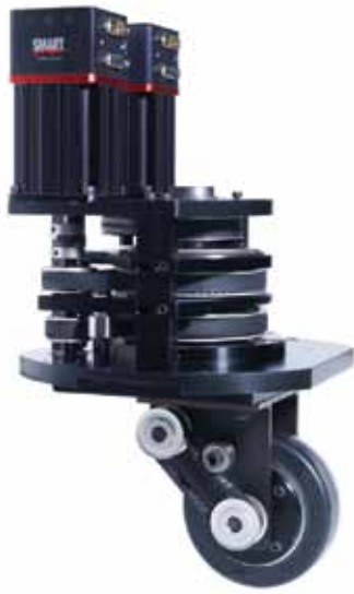
Interior configuration of a powered caster wheel