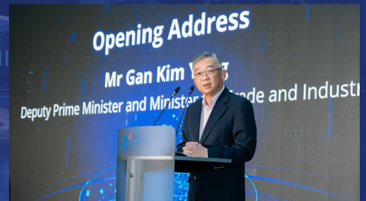
Deputy Prime Minister (DPM) and Minister for Trade and Industry Mr Gan Kim Yong during the launch of AIMfg on 14 Oct 2024

Don't miss the opportunity to be part of this movement with A*STAR. Organisations that join AIMfg gain early access to cutting-edge AI applications, collaborative innovation, and the chance to shape the future of Singapore's manufacturing sector.