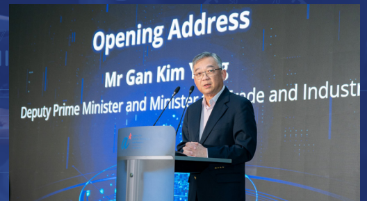
Deputy Prime Minister (DPM) and Minister for Trade and Industry Mr Gan Kim Yong during the launch of AIMfg on 14 Oct 2024

Don't miss the opportunity to be part of this movement with A*STAR. Organisations that join AIMfg gain early access to cutting-edge AI applications, collaborative innovation, and the chance to shape the future of Singapore's manufacturing sector.