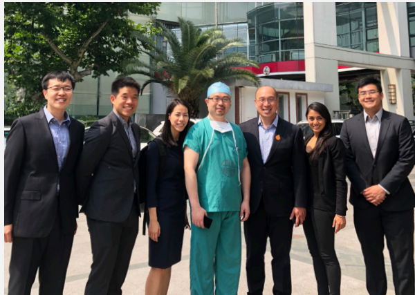
8SSB Fellows at Zhongshan Hospital Fudan University uncovering nuances about the Chinese diabetes patient journey for validation against their initial needs discovery from the U.S.