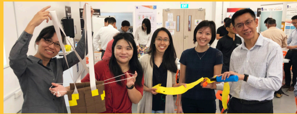
Bootcamp participants having fun during brainstorming, putting their hands together to use simple materials to test their hypotheses

SB has set up a rapid prototyping space at the engineering lab at A*STAR Central, our host institution A*STAR's open innovation lab. This space has been upgraded to improve access to our equipment and in-house engineering services so as to support the early engineering needs of healthtech projects. In particular, we provide an array of materials for general brainstorming and more specialized equipment for prototyping.