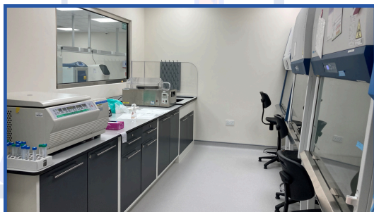
SHARED TISSUE CULTURE ROOM