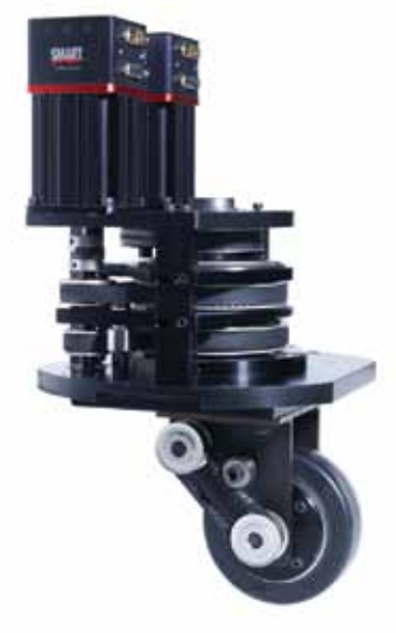
Interior configuration of a powered caster wheel